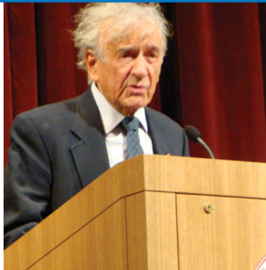
Elie Wiesel encourages students to think seriously about the ethical issues facing the world.