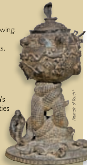
Fountain of Youth