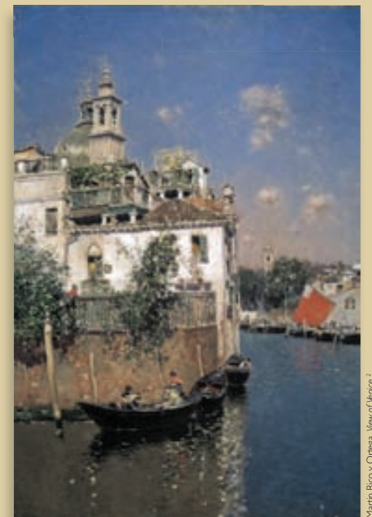
Martin Rico y Ortega, View of Venice 2